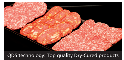
QDS technology: Top quality Dry-Cured products