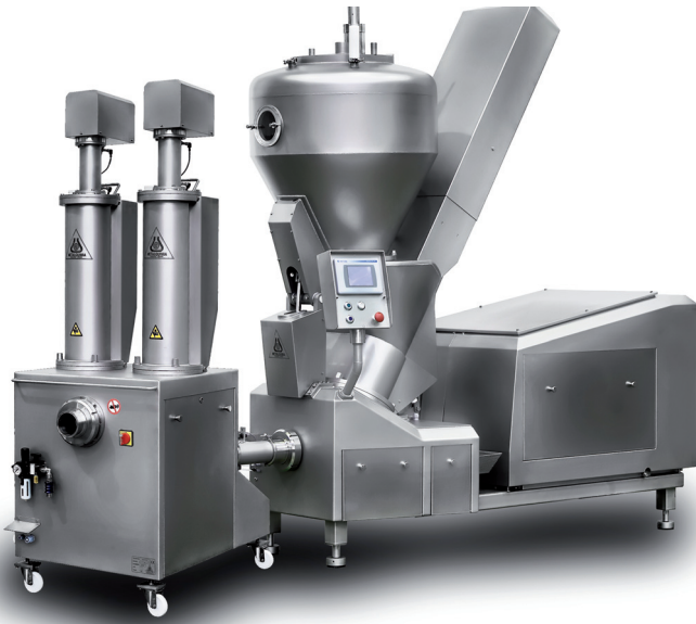
TWINVAC COMPACTA: zero holes and maximum precision in muscle stuffing

TWINVAC PLUS , together with PRECISION and COMPACTA engineering, provide maximum weight precision, top quality whole-muscle stuffing lines obtaining highly compacted slicing logs with fewer rejects in slicing lines, fewer internal holes, better muscle cohesion, more productivity and more automation. TWINVAC PRECISION & COMPACTA technology will be present at Metalquimia's booth at IFFA 2010 showing the most advanced and reliable whole-muscle stuffing lines in the world.