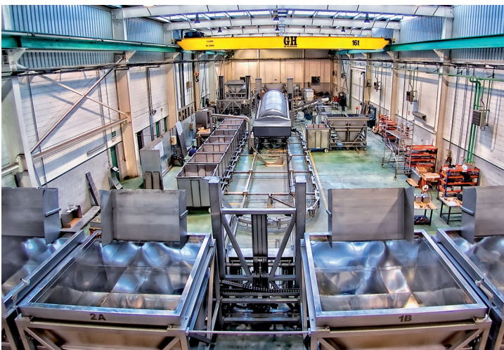
AUTOLINE: TWINLINE & COOKLINE assembling process at MQ workshops

Metalquimia presents the impressive automatic ham processing & cooking plants TWINLINE & COOKLINE , which integrate injection, tenderization, massaging, maturation, stuffing, clipping, cooking and cooling, in an entirely automatic and continuous flow line. AUTOLINES presented by Metalquimia are the most modern, productive, versatile, compact, energy-efficient, safe, clean and profitable systems in the world meat market, for processing cooked meat products with completely proven vanguard technology.