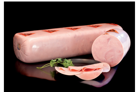
3-option tenderizing: 3 new ways of getting a cost efficient product

The brand new 3-OPTION meat tenderizers that METALQUIMIA is introducing at IFFA 2010, provide maximum increase of the protein extraction surface, with a reduction in cooking loss, improving final yield, minimizing defects of intermuscular binding, and preventing the appearance of holes in the sliced product.