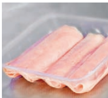
Twin filogrind greatly improves slicing yields

muscular binding and reducing muscle crumbling due to PSE meat. The TWINFILOGRIND system also prevents the appearance of holes in the slice while reducing trimming work required during meat preparation.