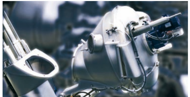
The assembly process of the new TWINVAC PLUS series

▶ METALQUIMIA will introduce, for the very first time in Frankfurt, the new TWINVAC PLUS series, showing the most efficient and profitable options in high-power automatic continuous whole muscle vacuum stuffers. The new TWINVAC PLUS stuffer program offers meat processors, gentle handling at extra high power and the highest productivity of the market, together with a complete line of automatic stuffing accessories for peak performance processing.