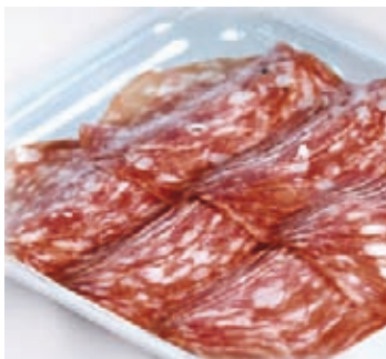
“QDS Process”— the 2007 processing revolution

Without doubt, this will be one of the leading attractions at IFFA—the latest technology in dry-cured meat products processing. To discover this new star in the METAL-QUIMIA UNIVERSE, we invite you to visit our booth and be a true witnesses to the coming meat processing future. ▼