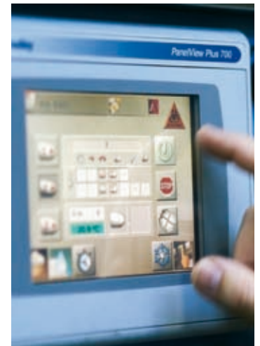
Brand new autoloading features for tumbling/massaging systems