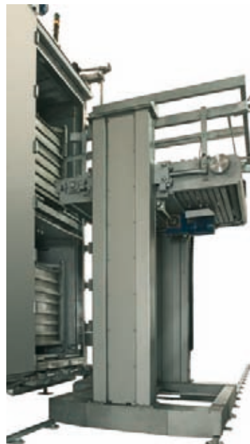
COOKLINE: forced convection cooking and cooling

▶ By means of Forced Convection Cooking & Cooling technology, METALQUIMIA presents the COOKLINE, the latest in terms of thermal efficiency and cost performance, product versatility, thermal parameters management, full automation, traceability, productivity, ergonomic operation, maintenance, durability and, of course, profitability for a Cooking/Cooling Process.