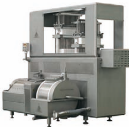
The new Movistick 4500 CR: reinvented bone-in injection

Moreover, METALQUIMIA will show the BBV LINE, a complete one-step-process line with increased productivity, reinvented capabilities and new operating options, opening up a wide range of manufacturing possibilities and offering precision control throughout the entire massage-maturation process.